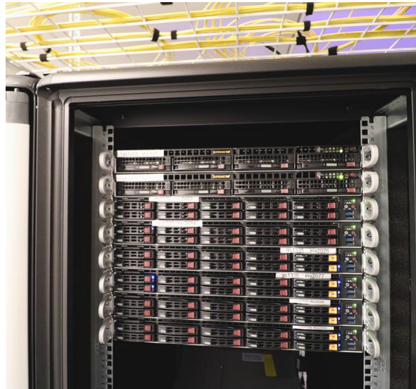
Image 2 - Supermicro Servers at GleSYS

GleSYS runs several VMware software suites, including ESXi and vCloud, and a homegrown flavor of KVM. This software allows GleSYS to offer a range of services to its customers that suit their different requirements. For example, customers may request bare metal servers or share a server through a virtualization layer. The newer Intel CPUs also contained more cores at higher GHz and faster communication to peripherals. In addition, significantly larger amounts of memory were part of the servers, allowing more complex simulations to be run.