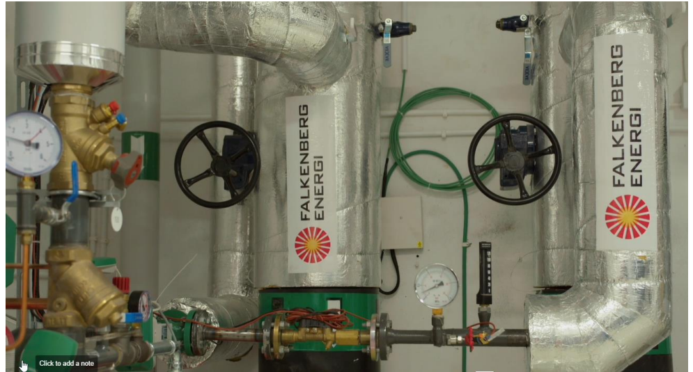
Image 3 - Transfer of Data Center Excess Heat to the Municipal District Heating System