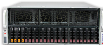
SYS-421GE-TNRT / SYS-521GE-TNRT / AS-4125GS-TNRT