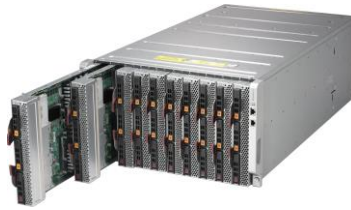
SuperBlade Chassis 6U