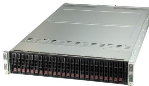
TwinPro w/4 Nodes

TwinPro® systems will excel when utilizing the new 3 rd Gen Intel Xeon Scalable processor features, specifically the increased core count and clock rates, faster communication through PCI-E 4.0, larger memory addressability, and support for single-socket or dual-socket configurations to deliver cost-optimized performance with Dual-10G ethernet onboard.