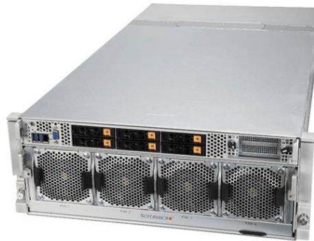
GPU with HGX

For the Supermicro GPU systems, all of the new features of the 3 rd Gen Intel Xeon Scalable processors will help high-end applications perform better and return faster with the latest GPU systems from Supermicro. More and faster cores, higher bandwidth to the GPUs and other devices, and the ability to address vast amounts of memory are exactly what large HPC and AI applications demand.