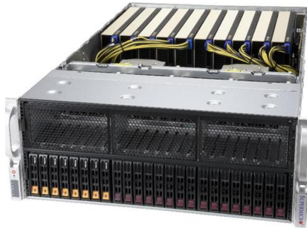
GPU System w/PCI-E

GPU Systems with PCI-E will benefit significantly from the PCI-E 4.0 communications bus, the increased number of cores, and the six TB to 12 TB memory per CPU for large applications.