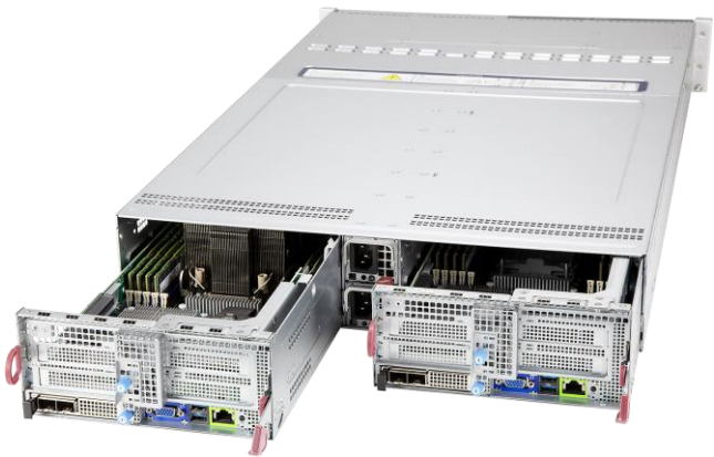
BigTwin w/2 Nodes

The 3 rd Gen Intel Xeon Scalable processors' best features include more cores, higher clock cycles, two 512-bit FMA units, new AI-optimized instruction sets, increased memory size, SGX support, and PCI-E 4.0 NVMe storage & I/O performance.