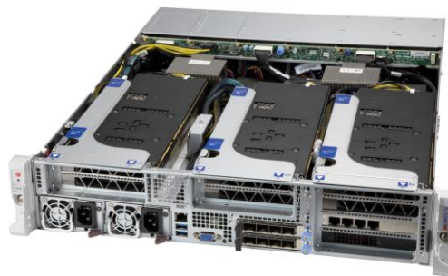
2U Hyper / Hyper-E

Hyper and Hyper-E systems will benefit from the increased core count at similar pricing with the 3 rd Gen Intel Xeon Scalable processors. The faster PCI-E 4.0 communications bus will give more rapid access to storage devices