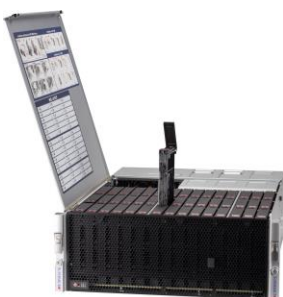
90 Bay SuperStorage System

The SuperStorage systems will benefit from the increased clock rates and PCI-E 4.0 I/O speeds with the 3 rd Gen Intel Xeon Scalable processors.