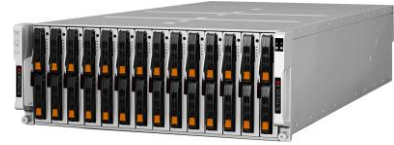
SuperBlade Chassis 4U

A significant advantage of the Supermicro SuperBlades is that cooling and power are shared between the server blades, which reduces power consumption compared to individual rackmount servers that contain their own and non-sharable fans and power supplies. Supermicro offers liquid cooling for the 8U enclosure, which is required if the blade accommodates two high TDP (>220 W) 3 rd Gen Intel Xeon Scalable processors.