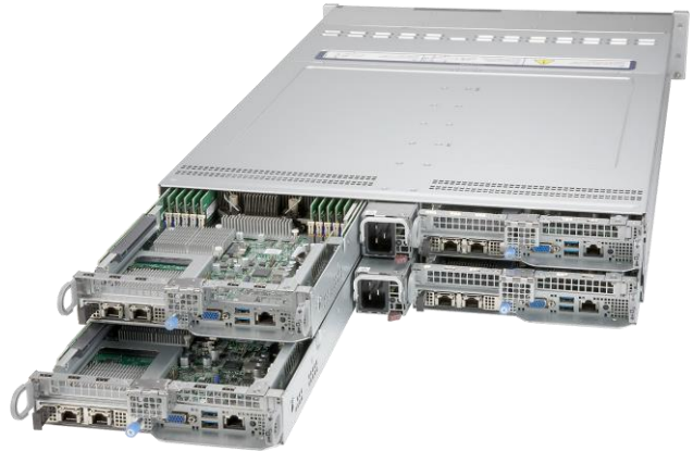
BigTwin w/4 Nodes