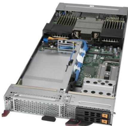
1 Socket Blade

Many of the 3 rd Gen Intel Xeon Scalable processor's new features will benefit all users of the SuperBlades. For example, the increased core count, performance, and amount of directly addressable memory are extremely valuable for workloads running on the SuperBlades. Also, support for PCI-E 4.0 allows for faster communication with GPUs that are installed on the blades.