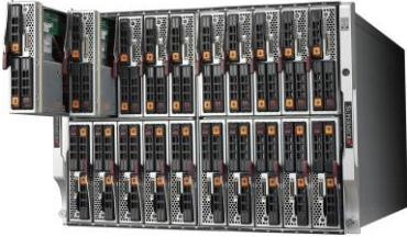
SuperBlade Chassis 8U