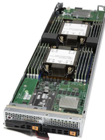
2 Socket Blade