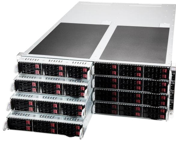
FatTwin w/8 Nodes