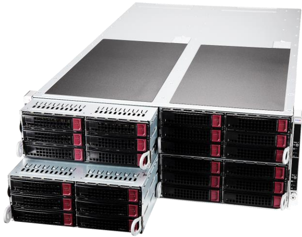
FatTwin w/4 Nodes