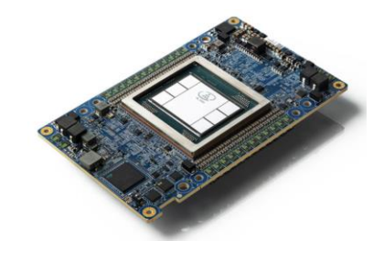
Intel® Gaudi® 2 AI Accelerator