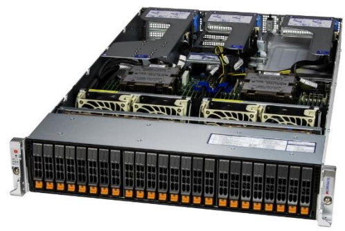
Fig. 3 Hyper A+ Server AS -2125HS-TNR