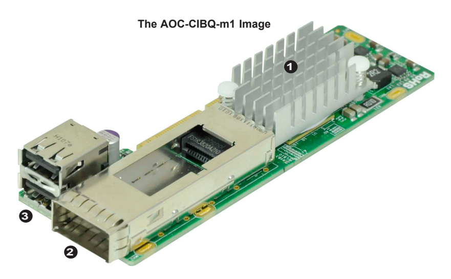
The AOC-CIBQ-m1 Layout