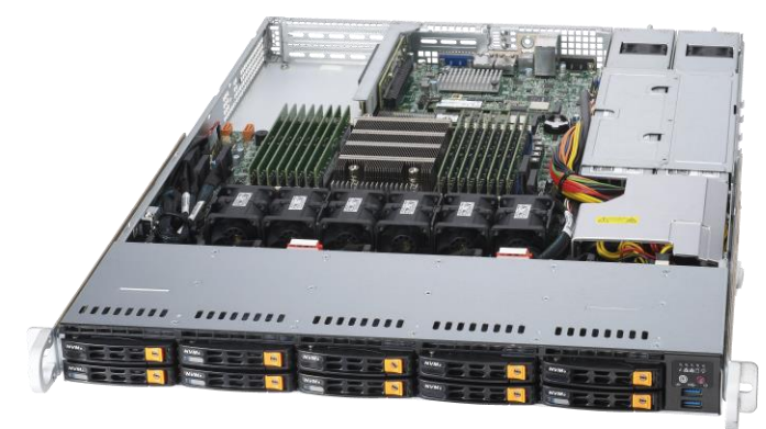
A + Single AMD EPYC™ 7003/7002 Series All-Flash NVMe Platform - AS -1114S-WN10RT

Supermicro & Qumulo Solutions for Life Sciences